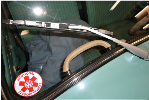
Late model style wiper blades just don't have the correct vintage look for Gertrude!