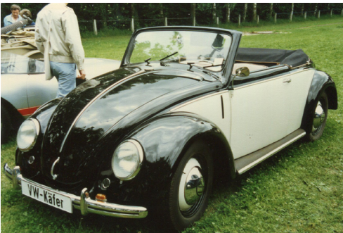
Hebmueller, a 2 seat convertible on a VW pan. Not many of these were made.