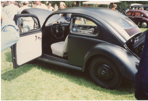
Avery early Beetle