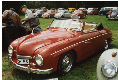
Romestch cabriolet, also on a VW