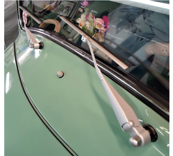
The finished product, period correct wiper blades with that vintage vibe!

Finally, a Gertrude project that didn't require days and days to complete! Less than 2 hours, start to finish. When Dad restored Gertrude back in the 70's, he updated the electrical system to 12 volts (thanks Dad!), and also installed a late model wiper motor assembly. With that comes the late model wiper arms and blades. The latest wiper blades that I could source were just really out of place and didn't have the correct vintage vibe. I decided it was time to see if I could adapt the correct style wiper blade to the existing arm. With a quick cut and slight bend, the