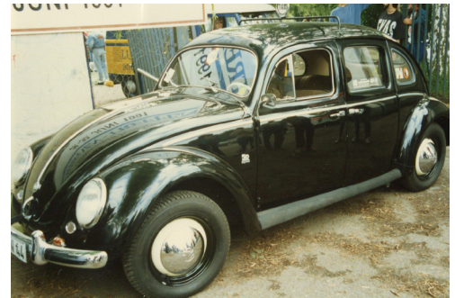
How many 4 door Beetles have you seen? These were modified by Romestch to be used as Taxis