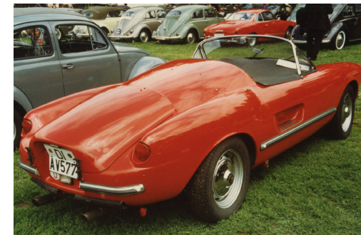
Einsmann - Another VW with a special body