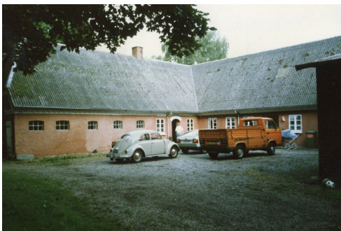
Greg's farm house in Denmark

Here are some pictures from the Bad Camberg show: