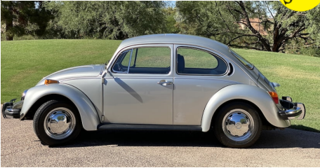
LOT T57 1977 Volkswagen Beetle 1,500 Miles, Sunroof