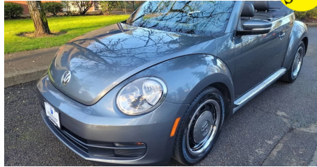
LOT T184 2013 Volkswagen Beetle Convertible 2.5L, Automatic