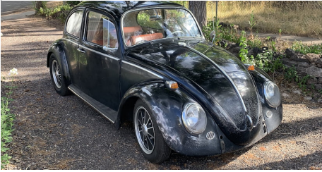
LOT T4 1965 Volkswagen Beetle Coupe 2276cc