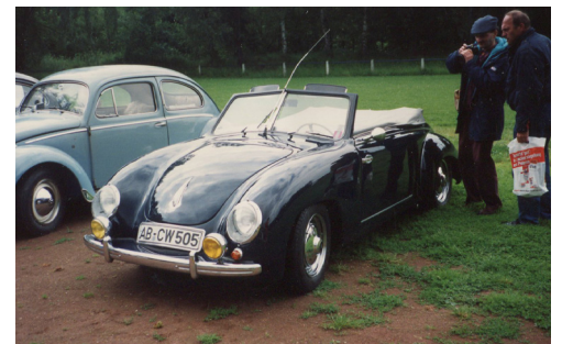
Another special bodied VW. No it is not a 356. It is a Danhauer-Straus, modified in Switzerland. In my opinion, it is the most successful of the early special bodied VWs.