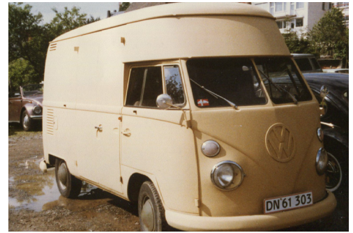
High roof bus