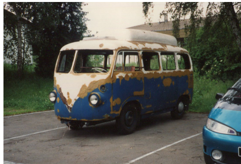
An East German copy of the VW bus