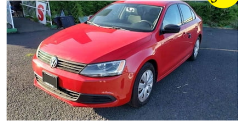
LOT T207 2012 Volkswagen Jetta Sedan 2.0L, Automatic