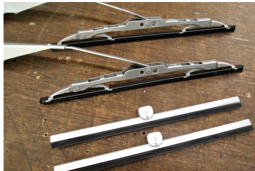
A comparison of the correct style blades to the modern style.