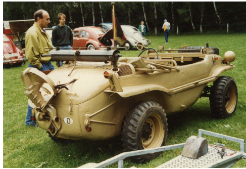
Schwimwagen. Those German soldiers must have been short and agile. These are sooo cramped.