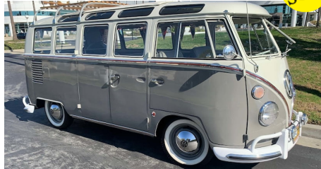
LOT S96.1 1964 Volkswagen Type II Samba Bus 2332cc, Ground-Up Restoration