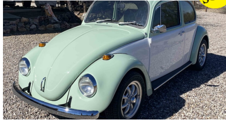
LOT T11 1969 Volkswagen Beetle 1600cc, 4-Speed