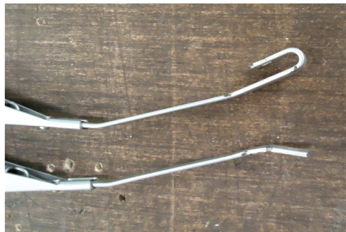
A before and after shot of the modified wiper arm.