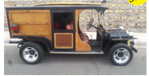
LOT T54 1965 Volkswagen Custom Custom Build