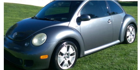
LOT F54 2002 Volkswagen Beetle Turbo S 25th Anniversary 1.8L/180 HP, 6-Speed