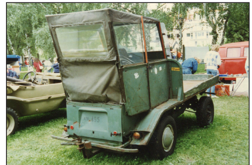
This strange vehicle was used to move materials in the VW plant in the early years