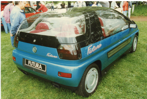
VW's view of the future in 1991