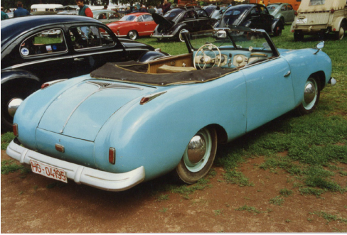
Another special, name unknown