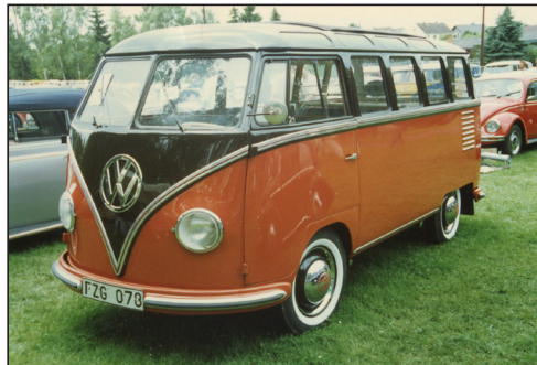
A beautiful barn door deluxe from Sweden