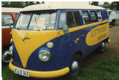
Even Lufthansa got in the act