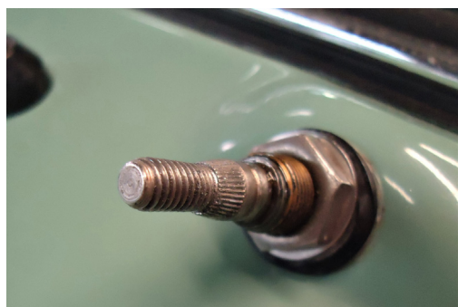
A perfect time to lube those wiper shafts.

Finally, a Gertrude project that didn't require days and days to complete! Less than 2 hours, start to finish. When Dad restored Gertrude back in the 70's, he updated the electrical system to 12 volts (thanks Dad!), and also installed a late model wiper motor assembly. With that comes the late model wiper arms and blades. The latest wiper blades that I could source were just really out of place and didn't have the correct vintage vibe. I decided it was time to see if I could adapt the correct style wiper blade to the existing arm. With a quick cut and slight bend, the