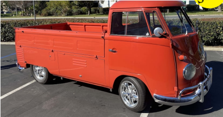
LOT S203 1959 Volkswagen Transporter Single Cab Pickup