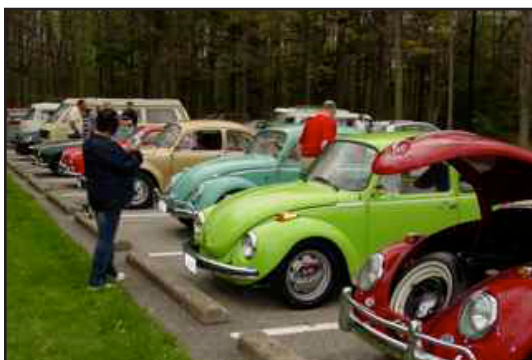
First Annual Spring Cruise lined up and ready to roll