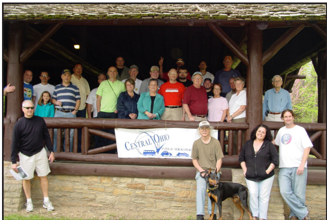
First Annual Spring Cruise In at the Metropark with the LEAKOIL bunch

The COVVC has warmly embraced their NEO VW friends and I am grateful for that. An important aspect of the COVVC annual Volksfest is the majority of the proceeds from the show goes to the Childhood Cancer Family Connection (Kids 'n Kamp). Over the years our club has donated well over $70,000 to support programs and services that are free for children, teens, young adults and families that suffer the trauma from cancer. I'm very proud of the fact and I think it's awesome that this club along with its love of VWs also has a giving heart. KnK has become a casualty of the pandemic, with the owners' retirement they've become part of the Columbus Foundation but I really appreciate all that they accomplished over many years. Now the club is starting a search for another worthy benefactor, and with more Volksfest's to come I look forward to helping others in the future – it's all thanks to the Volunteers in our club that put together such a wonderful show to entice all of those VW enthusiast to return each year!