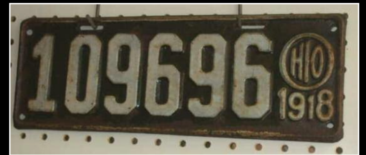
Check out the neat Ohio logo