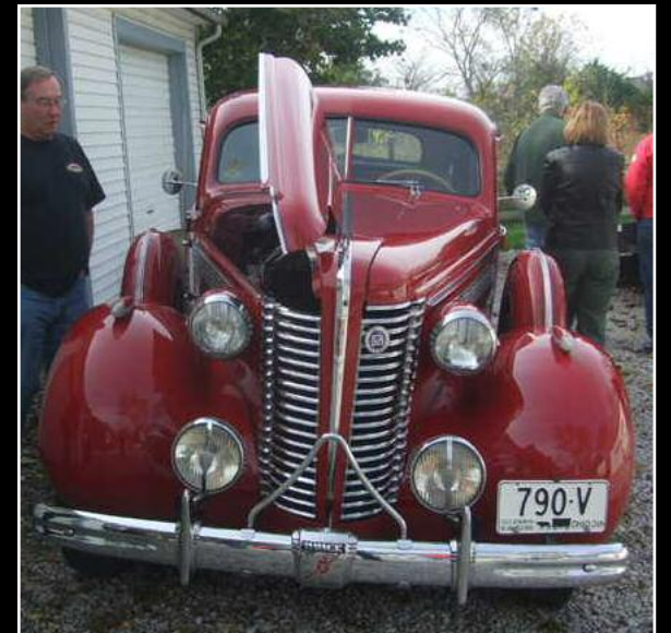
Lovely old Buick