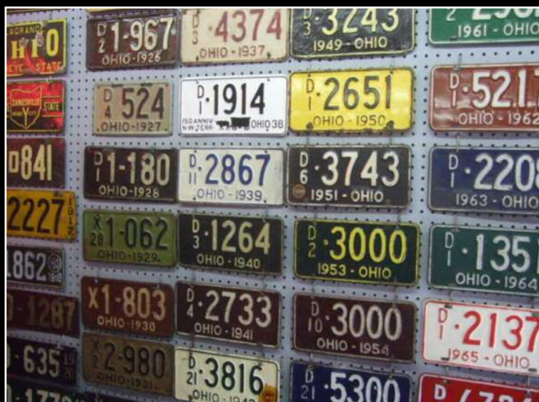
Cool vintage license plates