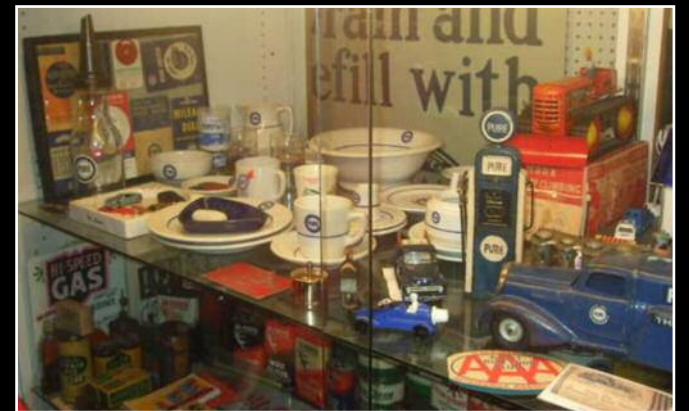
Pure Oil dinnerware